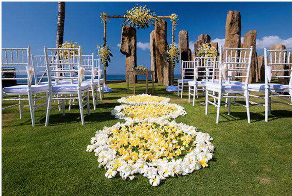
Intimate Frangipani Floral