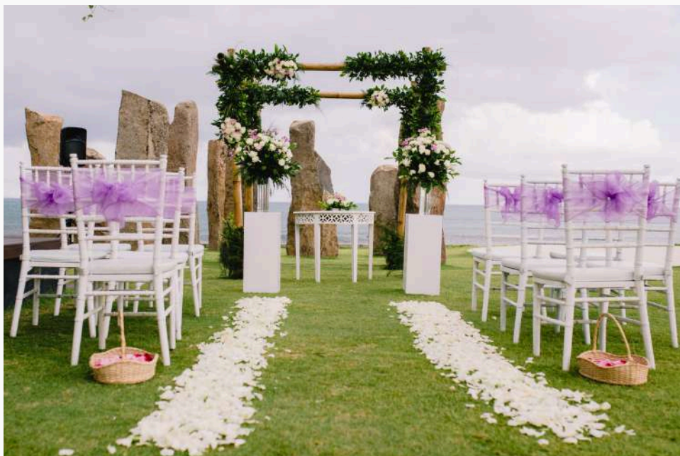
Romantic Purple and Green