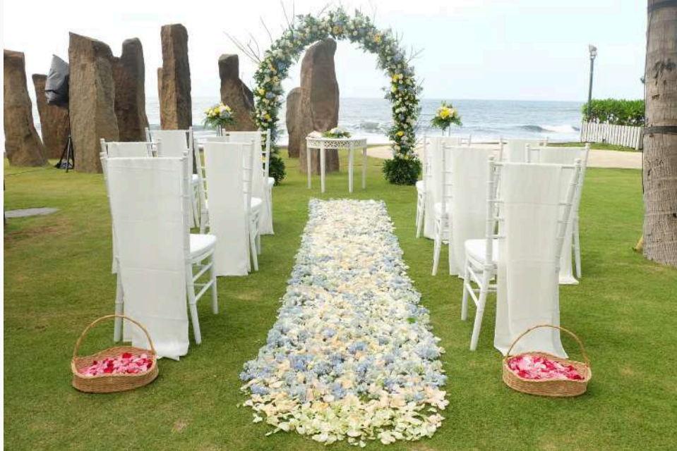
Romantic Floral Blue