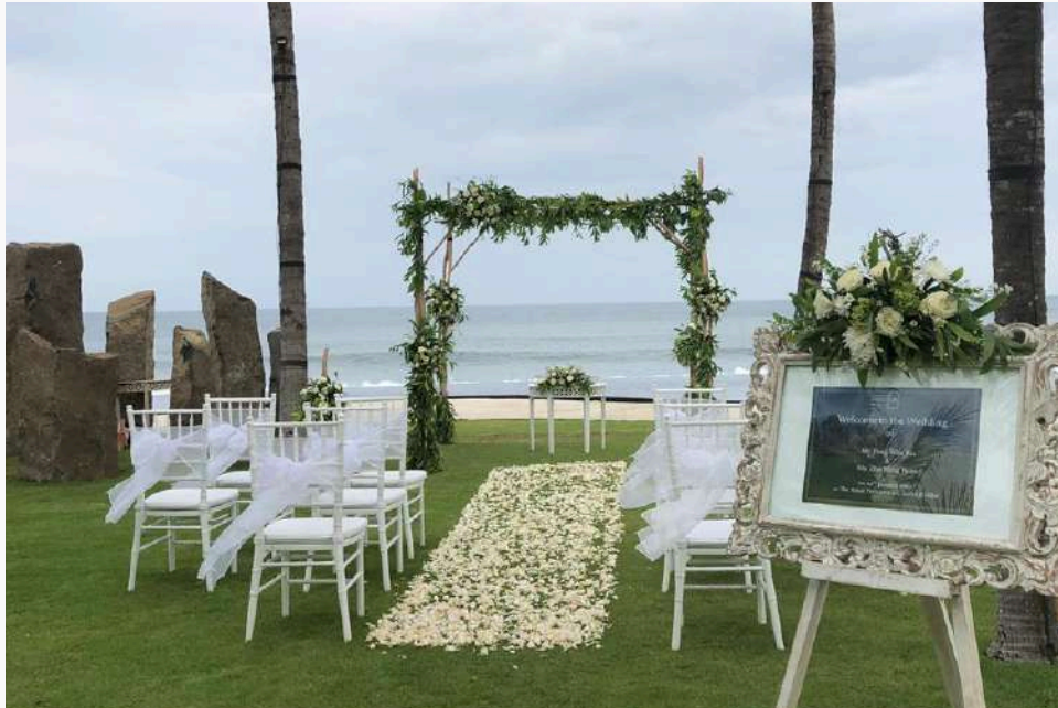
Intimate Green & White